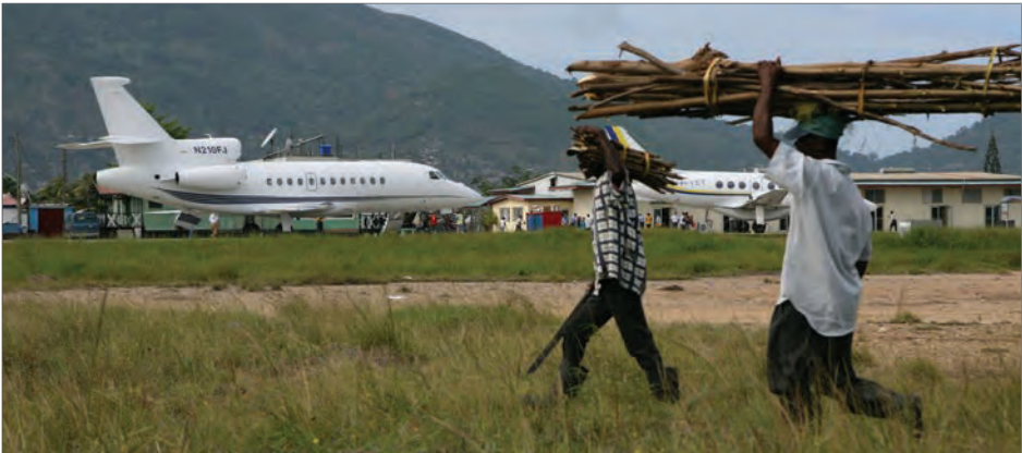
NBAA Members on a relief mission in Haiti following the January 2010 earthquake.