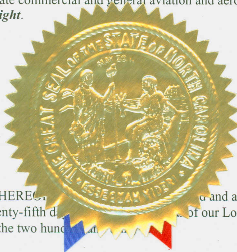
BEVERLY EAVES PERDUE

NOW, THEREFORE, I, BEVERLY EAVES PERDUE, Governor of the State of North Carolina, do hereby proclaim the week of December 3-10, 2010, as "AVIATION APPRECIATION WEEK" in North Carolina and commend its observance to all citizens as a time to celebrate commercial and general aviation and aerospace companies, and thank those who continue to keep North Carolina First in Flight .