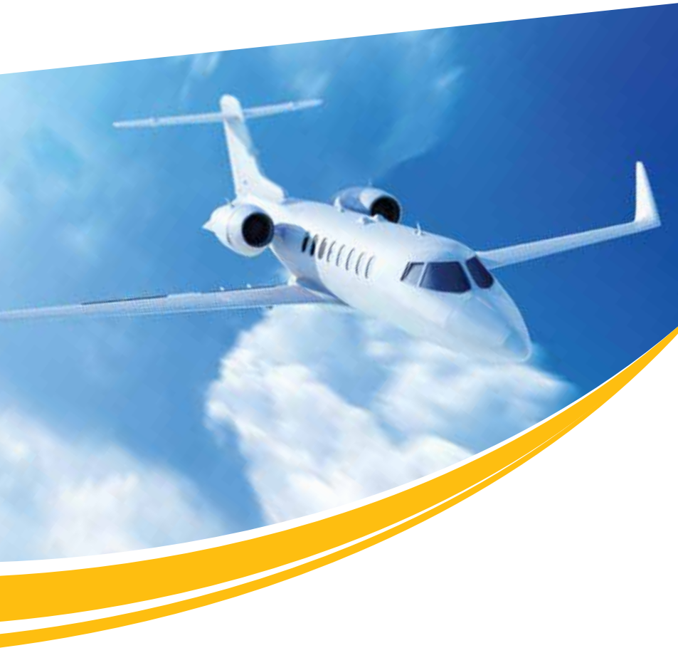
EXHIBIT SALES BROCHURE SCHEDULERS & DISPATCHERS CONFERENCE